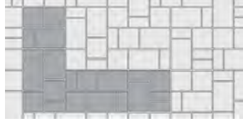
LP TREOSMOOTH FIXED RANDOM S PDF