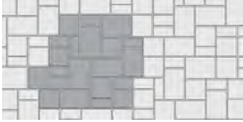
LP TREOSMOOTH FIXED RANDOM R PDF